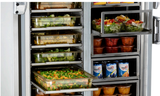
Shelves slide out easily for fast access to product. Drawers have clear Lexan® fronts for visibility to food type and supply, and provide extra temperature holding.

Whether you need shelves, drawers, or both, you can easily configure the inside of Aladdin's Convect-Rite® Select carts to meet your dining needs.