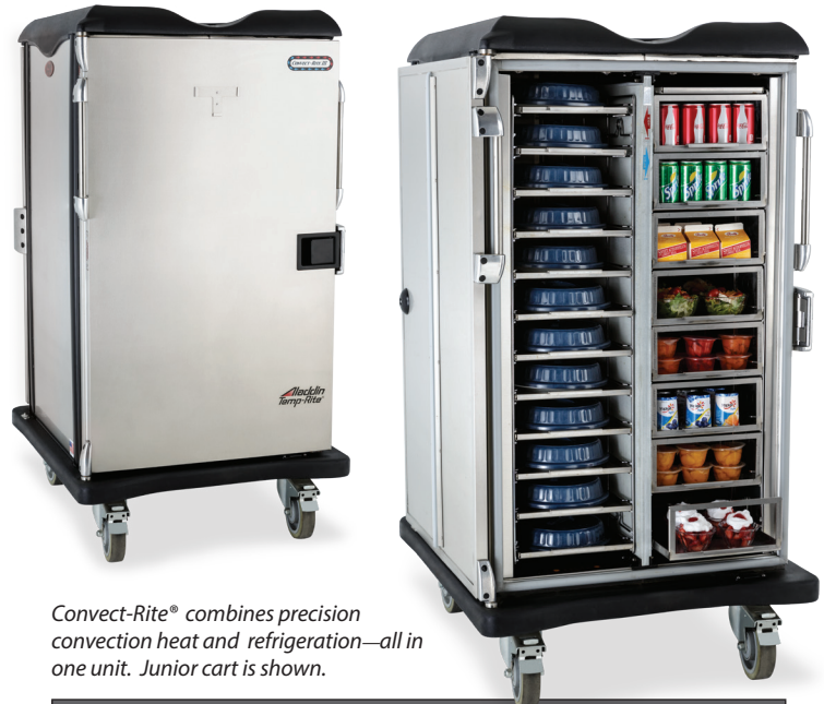
Convect-Rite® combines precision convection heat and refrigeration—all in one unit. Junior cart is shown.

Note: Specifications are subject to change without notice.